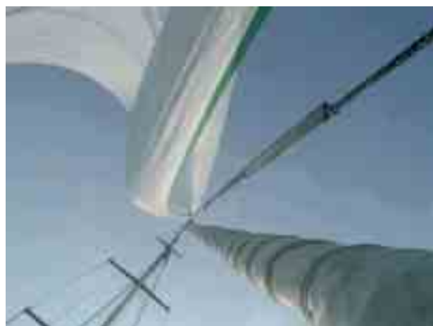
Stay length 38 mt.

The system is driven by a hydraulic or electric motor and makes use of a special self-aligning spheric construction. It has been designed to be flush-mounted on deck.