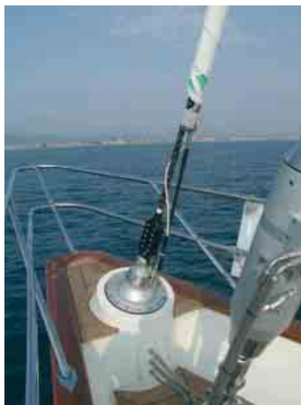
Perini Navi40 mt s/y "numero uno"